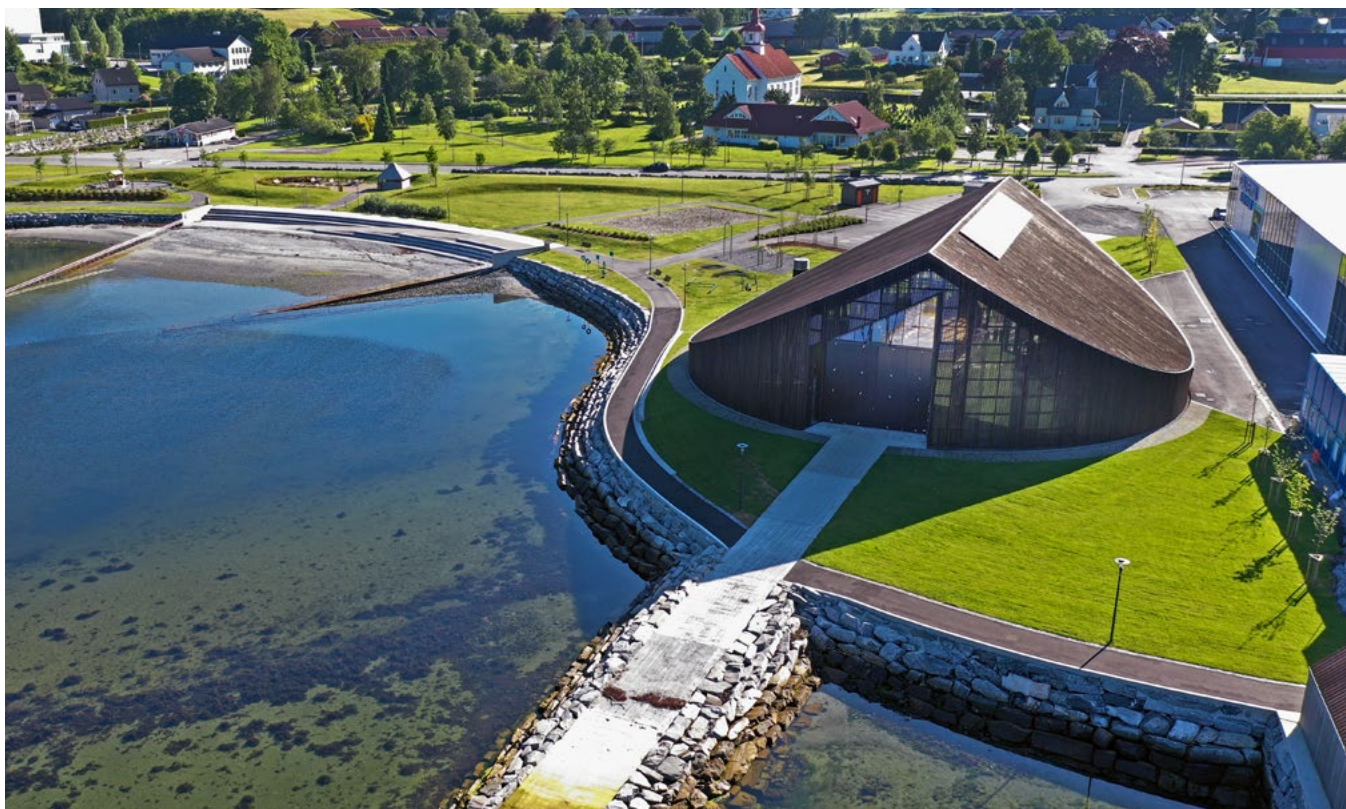
Sagastad at Nordfjordeid is a new knowledge center focusing on the Viking Age. The building is heated with fjord heating, has solar panels on the roof, and all lighting is LED. This provides an energy-efficient building that is self-sufficient in energy on hot and sunny days. Sagastad is financed with a green loan from KBN.

Kommunalbanken AS (KBN) is the Norwegian state agency for local government funding. KBN is 100 per cent owned by the Kingdom of Norway (AAA/Aaa) and is managed in accordance with the Central Government Maintenance Statement.